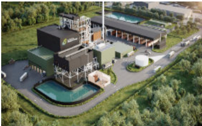
Rockingham waste to energy plant