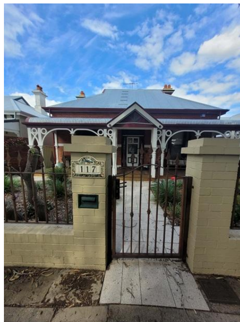
Subiaco Heritage Houses