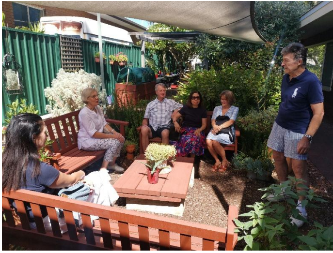
Term 1 Language Students